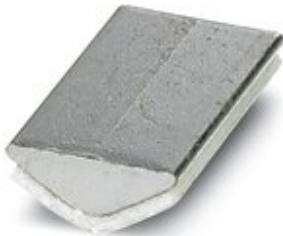
Insertion profile, color: silver

Please be informed that the data shown in this PDF Document is generated from our Online Catalog. Please find the complete data in the user's documentation. Our General Terms of Use for Downloads are valid ( http://phoenixcontact.com/download )